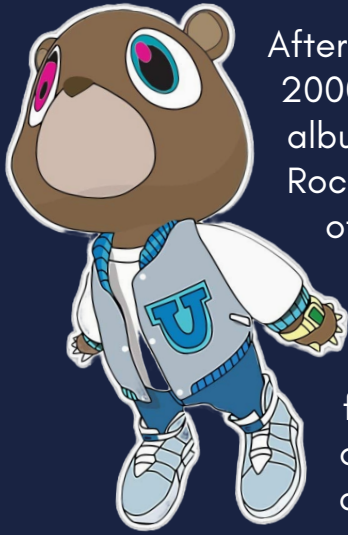
ILLUSTRATION BY TAKASHI MURAKAMI

After gaining fame in the early 2000s by working on JAY-Z's album "Blueprint" (2001) with Roc-A-Fella Records, he officially commenced his solo artist journey.